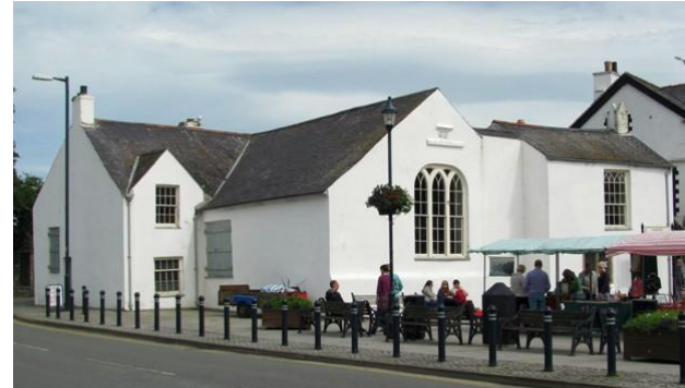
"Green Cottages" next door to the courthouse are renovated, but now have a garden area to the front which, although pretty, somewhat diminishes their previous distinctive character (right).....